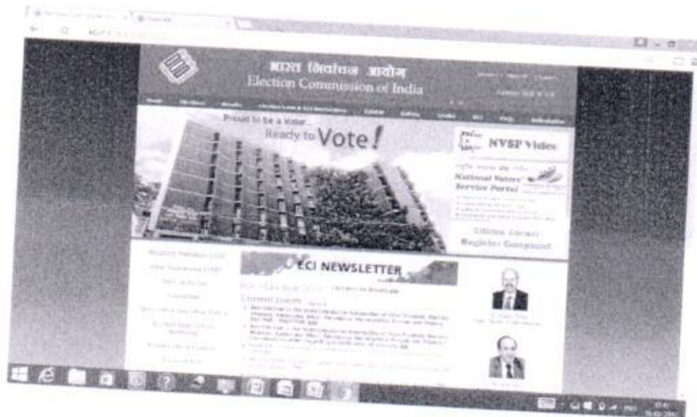
Fig 1.1 ECI website