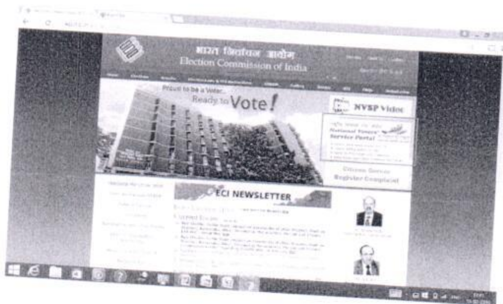
Fig 1.2 Click nvsp link