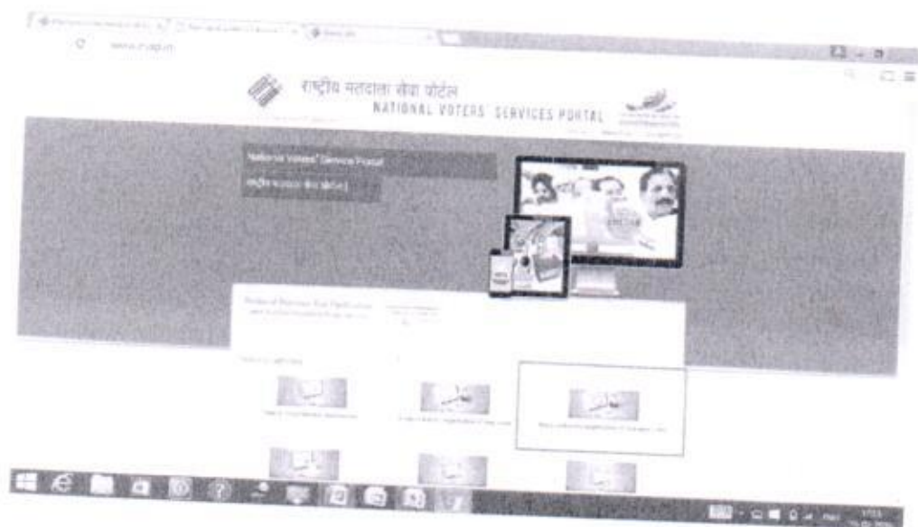
Fig 1.4 Click link 'Apply online for registration of overseas