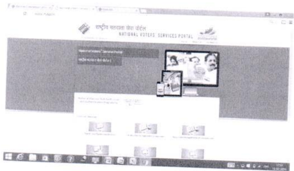
Fig 1.3 nvsp portal 'Home' page